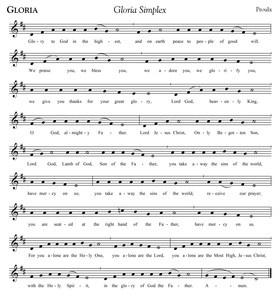
©2010 World Library Publications, a division of J.S. Paluch Company, Inc., Schiller Park, IL. 60176. All rights reserved. Reprinted under OneLicense.net #A-703573.